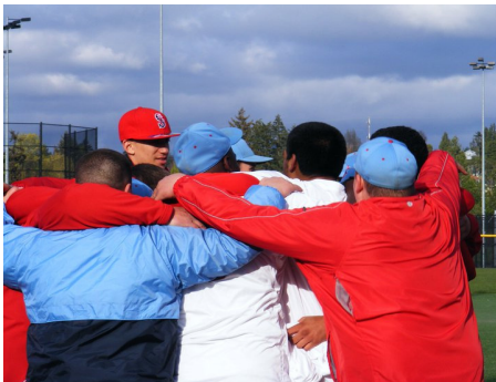
Leave your mark for generations to come!