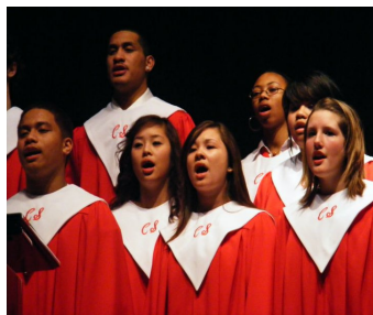
Support your Alma Mater!

Paver Price for the following message: $80